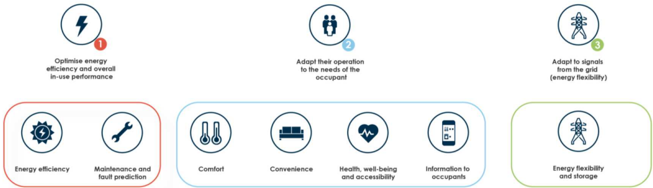
Fig. 1. The seven SRI impact categories.

There is a need for better data aggregation to speed up the process and implicitly increase the quality of the assessment. The use of BIM is therefore an opportunity for improving the effectiveness of the SRI assessment framework.